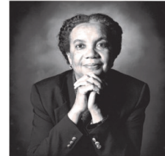
Marian Wright Edelman

Don't let anything stop you. There will be times when you'll be disappointed, but you can't stop.